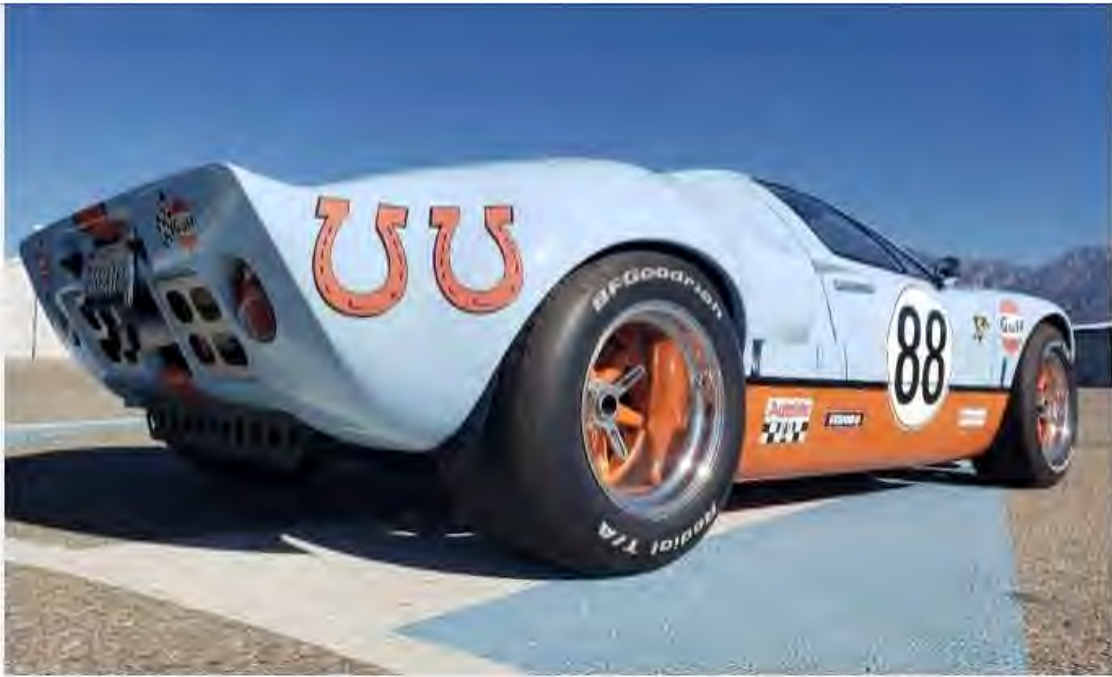
Cable Airport – Upland, California