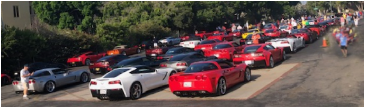
Departure staging in Pasadena on Day One of the 2019 Caravan. Imagine two more rows of cars in 2024