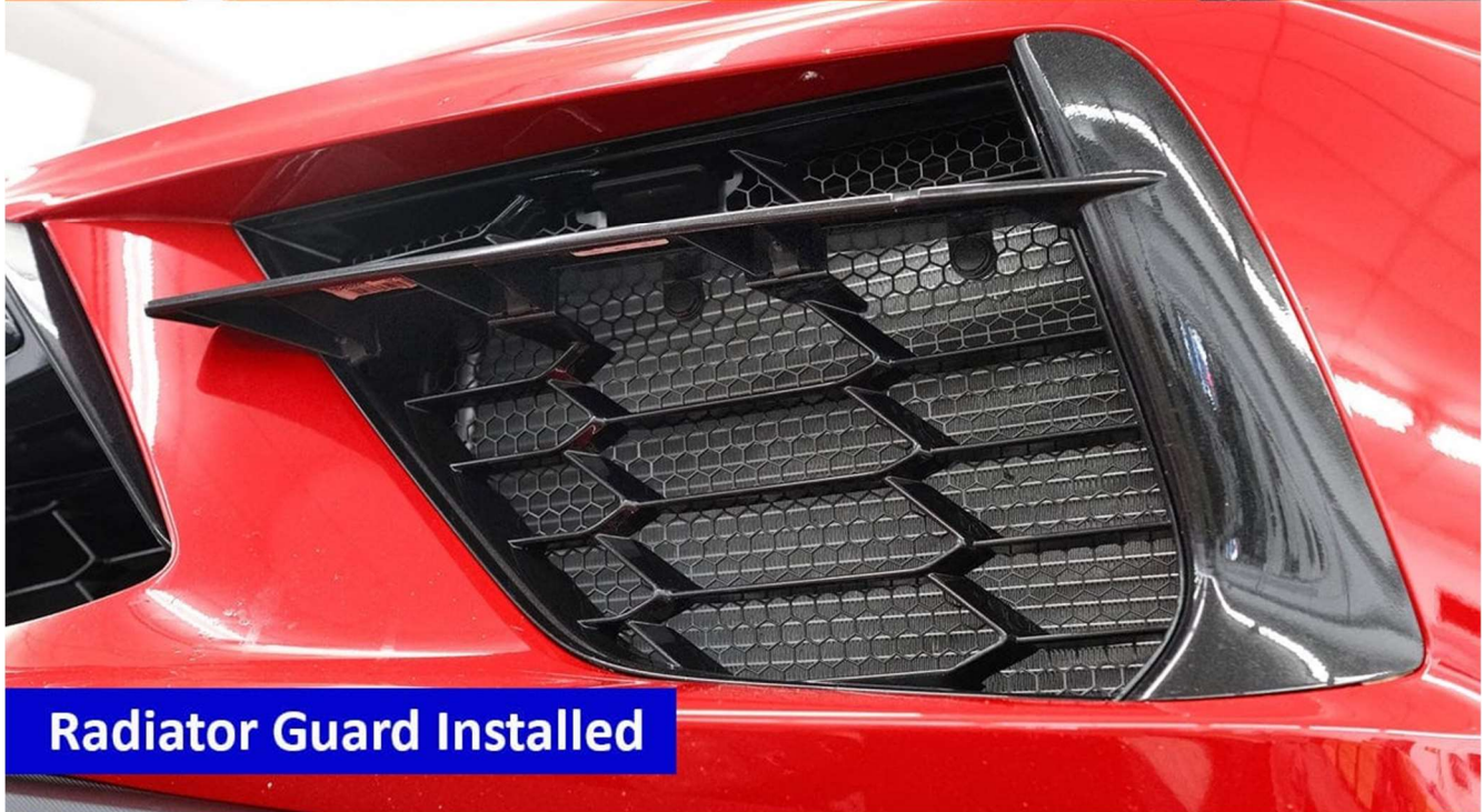
Radiator Guard Installed

There's no doubt about it. The C8 is one of the most beautiful cars on the road. Even so, there's room to transform your roadster (or HTC) into road art by enhancing its appearance. This next tip deals with wheel aesthetics. For me, the C 8's factory wheels are about as exciting as vanilla ice cream. They're cast aluminum, heavy, and their design could use improvement. If I had my "druthers," and an extra few thousand USD$, I'd be riding on something much more functional and visually appealing. That said, what to do if you don't have a few grand lying around to blow on a set of new wheels? Do what I did. Get out your can of spray paint and get busy.