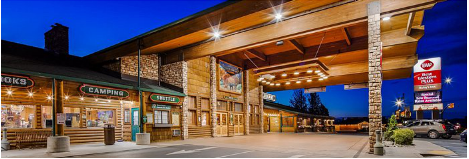
One of the three Best Western hotels that make up the Ruby's Inn complex.

A key objective of PreRun6 was to visit Ruby's Inn for a site inspection.