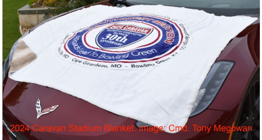
2024 Caravan Stadium Blanket.

Integrated Impressions of Laguna Nigel will supply the 2024 Blankets. They are 50 by 60 inches, borderless, fur-lined with the logo and text applied by dye sublimation printing.