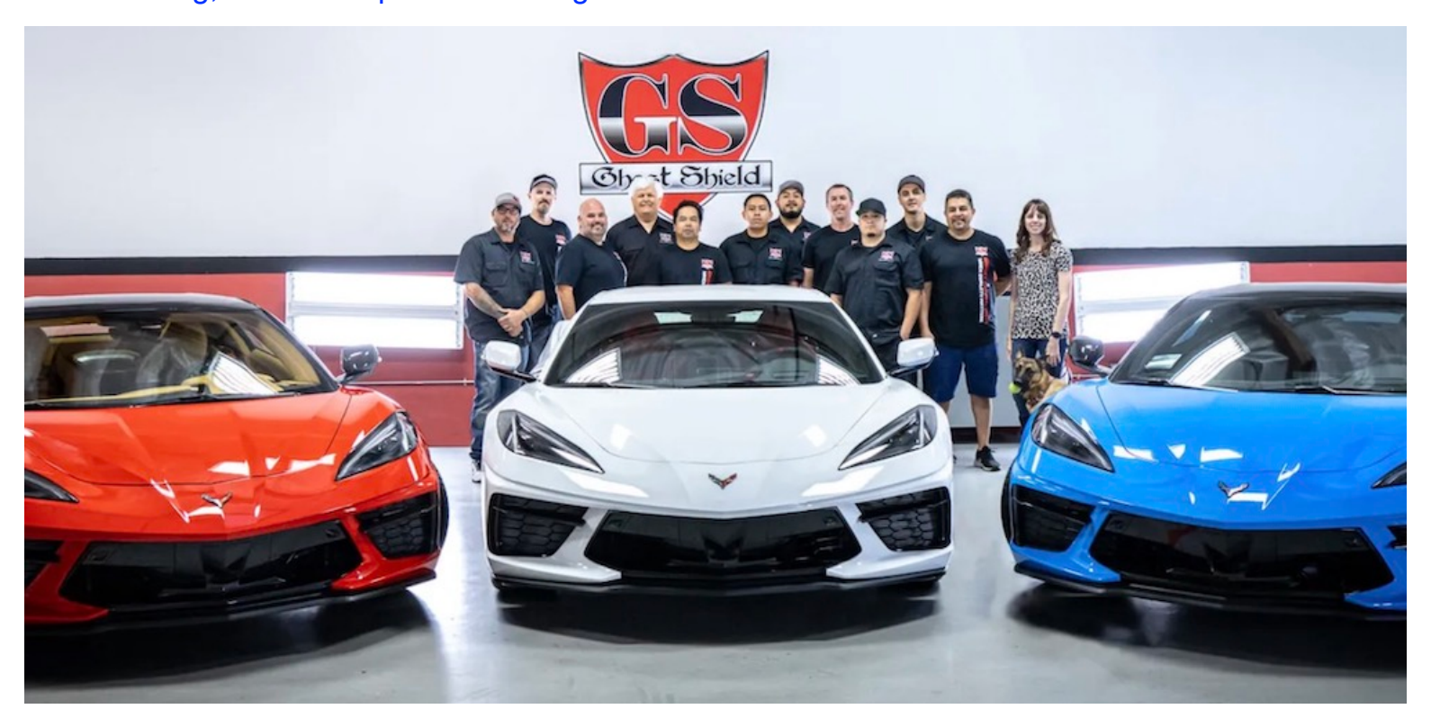
Ghost Shield's team of car care professionals can make a Southwest Caravaner's Corvette look like a show winner with Xpel PPF, ceramic coating, even a full car wrap, and...they'll do it for 20% off!

Ghost Shield Film, located just off the 101 Freeway in Thousand Oaks, is the Southwest Corvette Caravan's official paint protection film (PPF) and ceramic coating provider. Ghost Shield offers XPEL brand protection film ("clear bra") installations, full vehicle vinyl wraps, window tinting, exterior ceramic coating, and wheel powder coating.