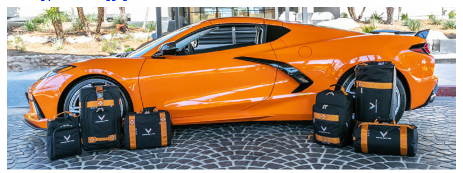
For '20-'23 C8 Corvettes, Club Glove has specially-sized luggage to fit both the "frunk" and trunk.

About 20 years ago, Club Glove designed the Last Bag's craftsmanship and durability into its line of Rollerized Luggage. In 2011 CG introduced the ultimate in travel luggage that will survive the most uncaringly ruthless baggage handlers, "TRS Ballistic".