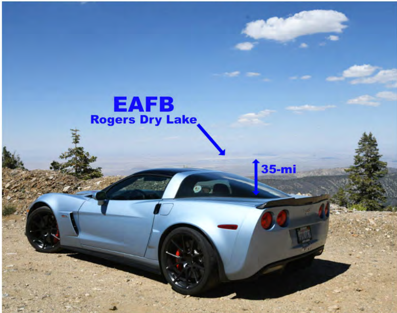
The Blue Bullet on AHC at the 7600-ft level looking north across the Antelope Valley at Edwards AFB