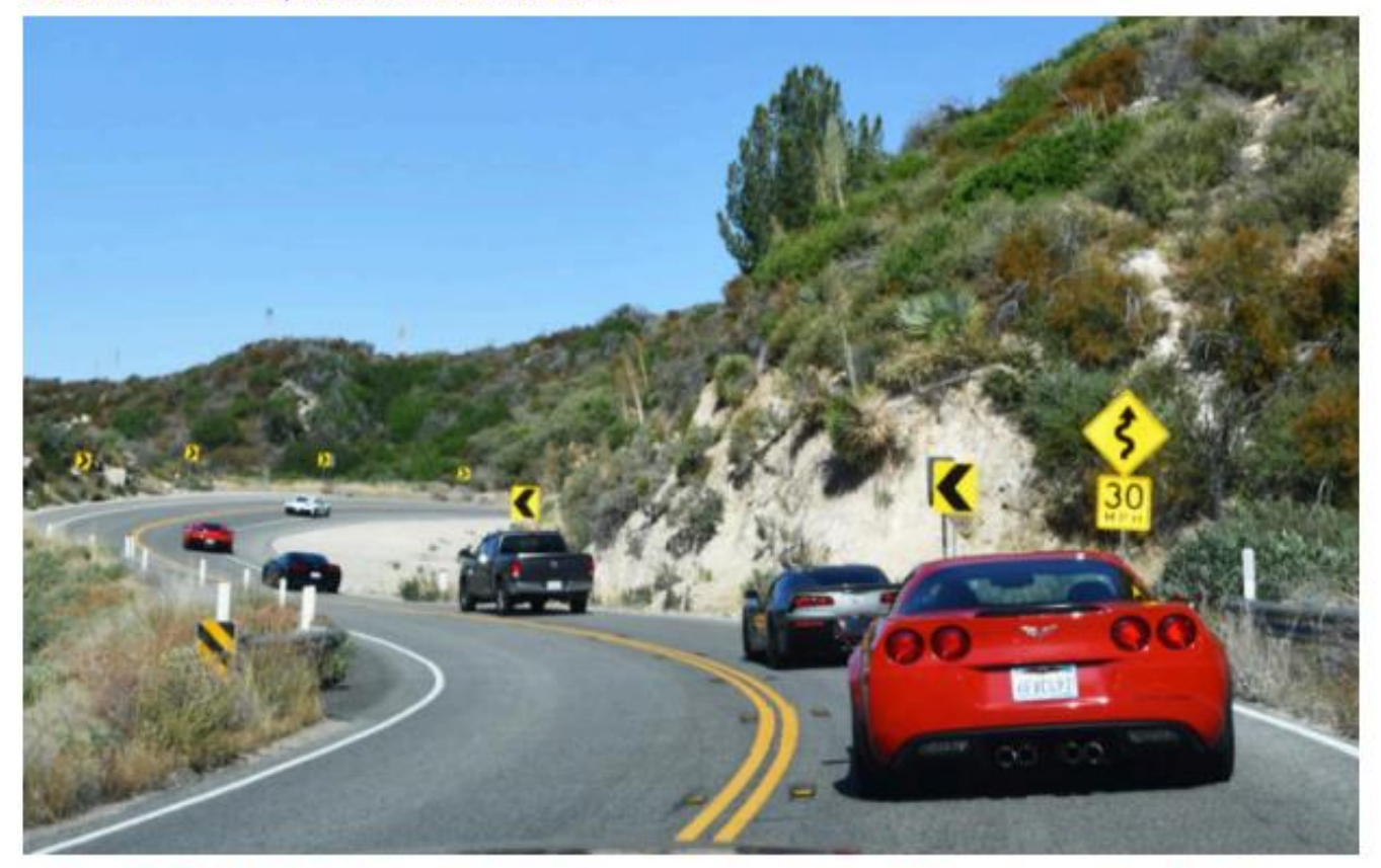
August 22, 2019: The Southwest Corvette Caravan on Angeles Crest Highway.