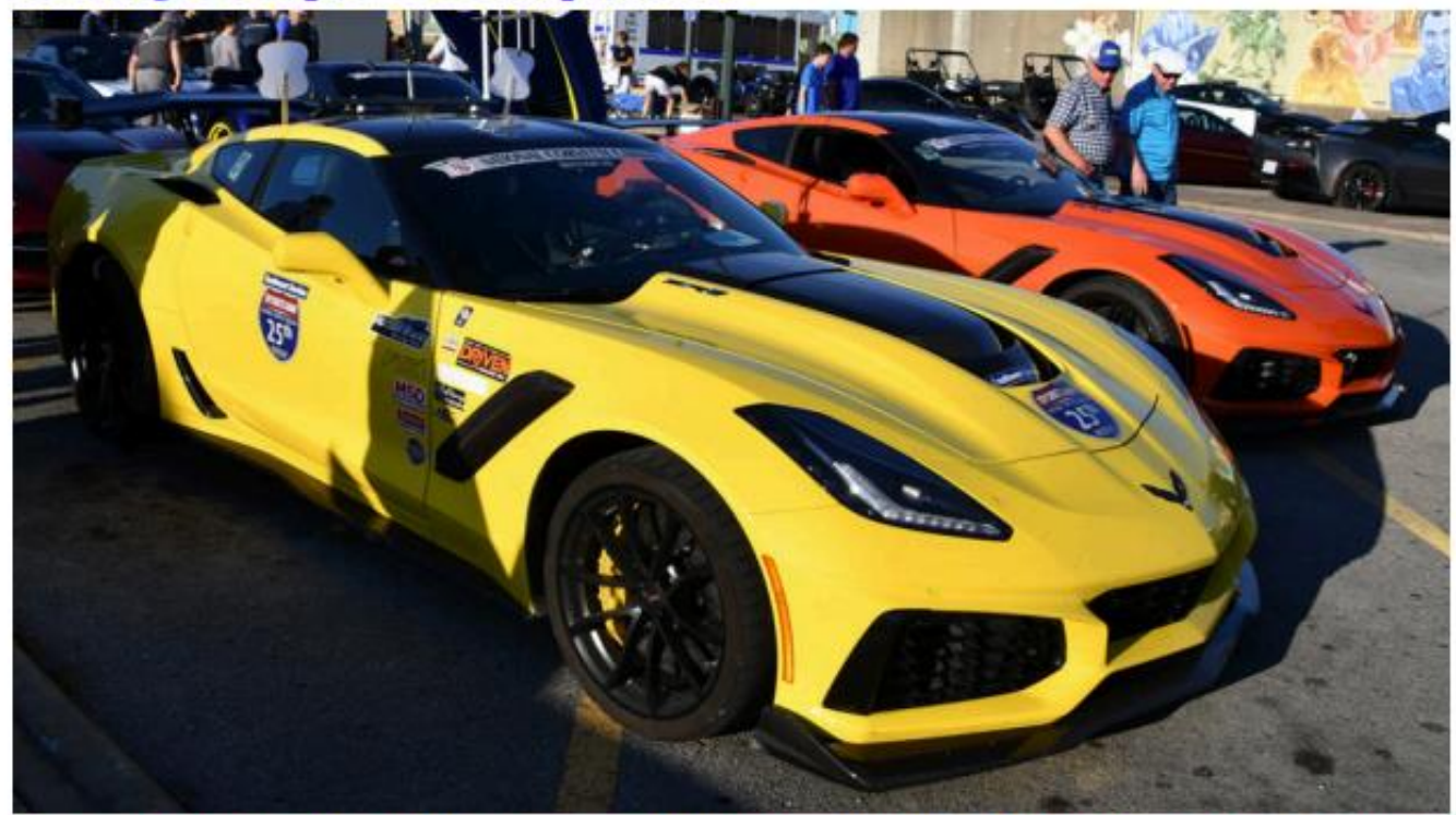
A pair of C7 ZR1s at Corvettes in Cape in 2019. Foreground: Back-Up Lead Car for the Southwest Section. Background: Lead Car for the Pacific Central Section.