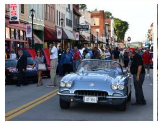
Corvettes in Cape drew non-caravaners from all over the region. This Missouri C1 owner drove to Gape G. to see the Caravan Corvettes.