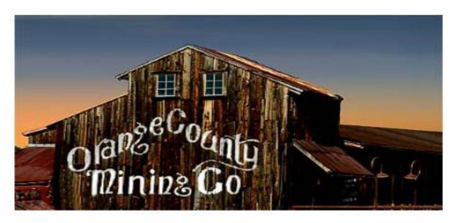
10000 S Crawford Canyon Rd, Santa Ana, CA 92705

Saturday December 4th 11am – 4 pm Price per person: $ 40.00 plus $ 7.00 per car parking Sign ups now: Payment due by November 23rd