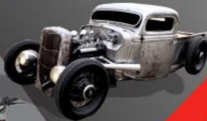
Grand Marshal Sunday