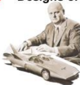
Talking About Cars Podcast - Host KNX 1070 Newsradio Sportscenter