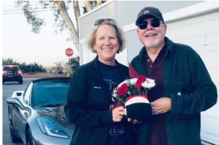
Card that was delivered with flower arrangements