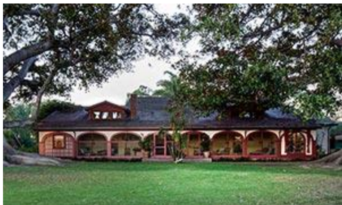
Rancho Los Alamitos ranch house