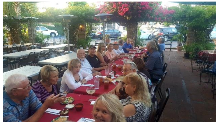
Group enjoys the lovely patio area