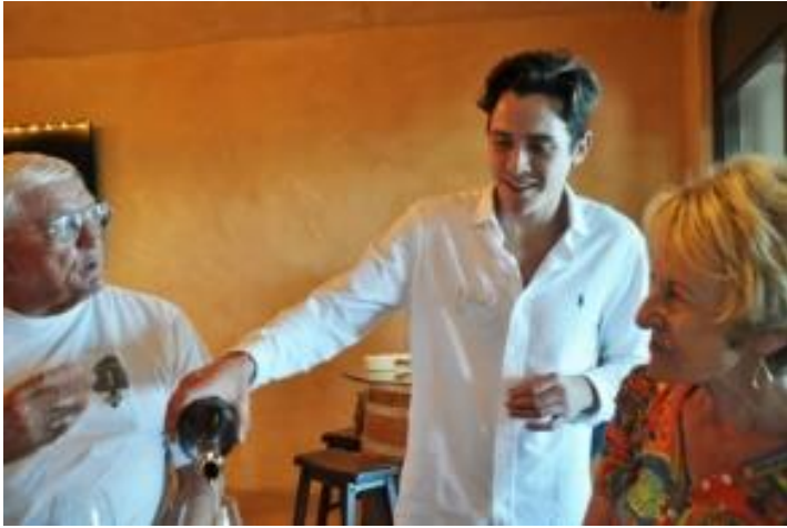
Our server poured the wine at Edna Valley Winery