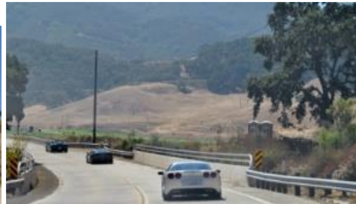
The drive took us through the countryside