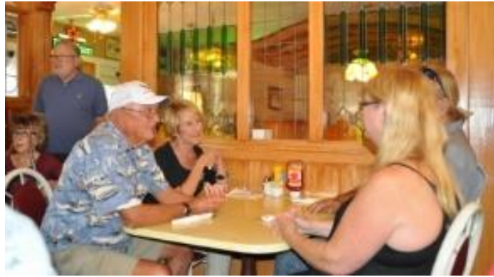
Lunch in Solvang

The hotel served breakfast, but for lunch and dinner Pismo Beach offered a lot of wonderful seafood restaurants such as Brad's Restaurant, the Cracked Crab, Splash Café, and Wooly's on the beach down by the pier where we all took turns trying out all kinds of great dishes. Shopping was also fun downtown. There was even a store that sold "the original edible insect candy". Scorpion suckers anyone?