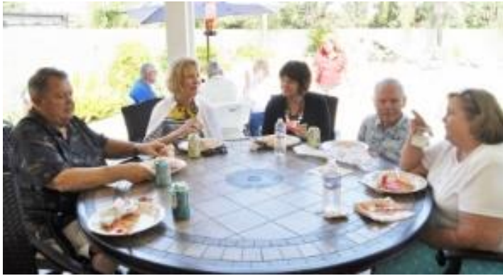
Everyone enjoyed having lunch outside on a lovely fall day