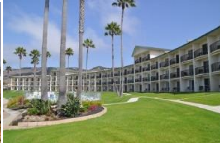
The Kon Tiki Hotel was a very nice property with great views and a LONG set of stairs down to the beach for the young at heart