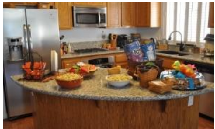
Betsy served lunch for the group