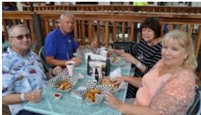
Lunch at Sebastian's