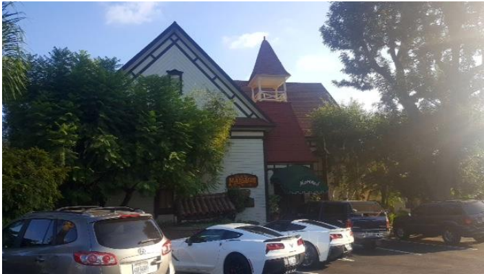
Historic Moreno's Mexican Grill