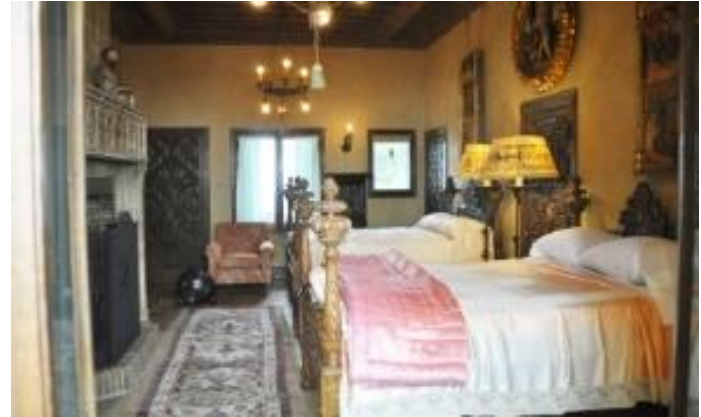
Hearst Castle guest rooms